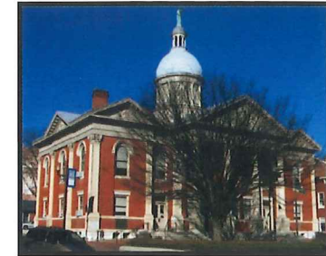
1901 Circuit Courthouse