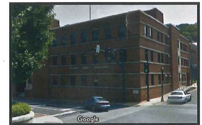
1953 General District & Juvenile Domestic Relations Courthouse