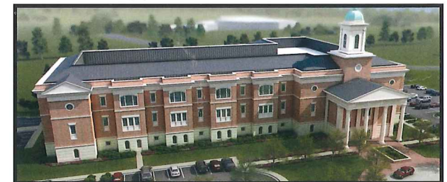
Proposed Courts Complex